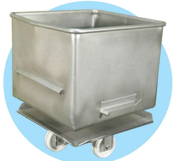
400 Lb Sani-Buggy - BG 101005

The Dolly has a 10ga top plate with a reinforced undercarriage that cross ties the four wheels together for added side to side and front to back strength as well as durability. Equipped with white poly wheels 6" x 2", a replaceable delrin bushing and a T-304 stainless steel axle equipped with zerk fitting for applying grease.