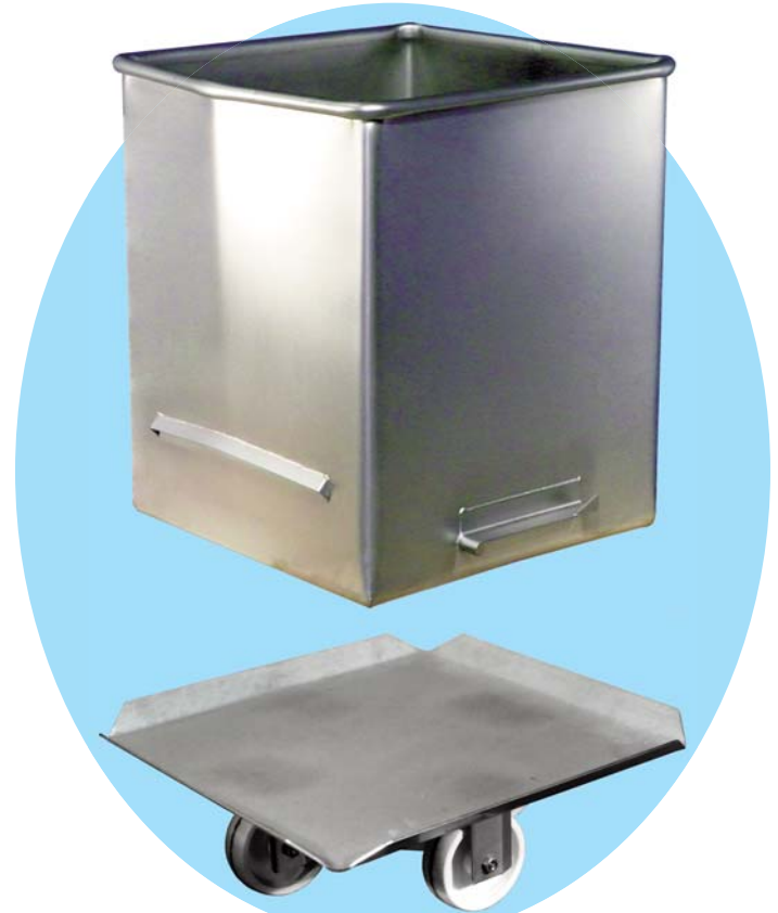
600 Lb Sani-Buggy - BG 101006