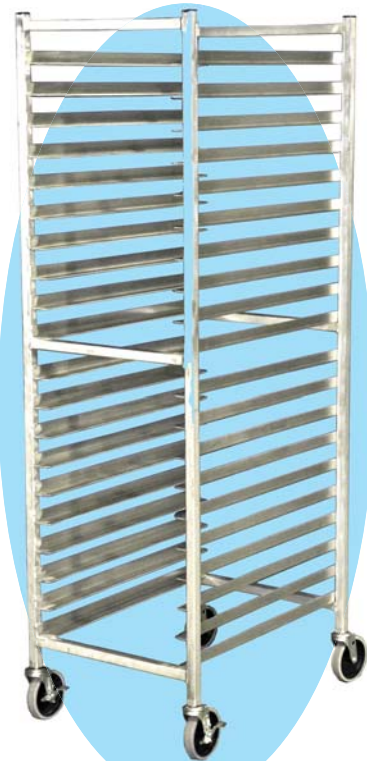
Aluminum, Fully Welded, End Load # DL102018

All our Platter Dollies are manufactured with heavy duty 1" square tube and are stable for storage or transportation of 18" x 26" Platters. Your choice of rustproof material: Stainless Steel or Aluminum. Features End Loaded or Side Loaded design with twenty levels and spacing between platters of 2-7/8".