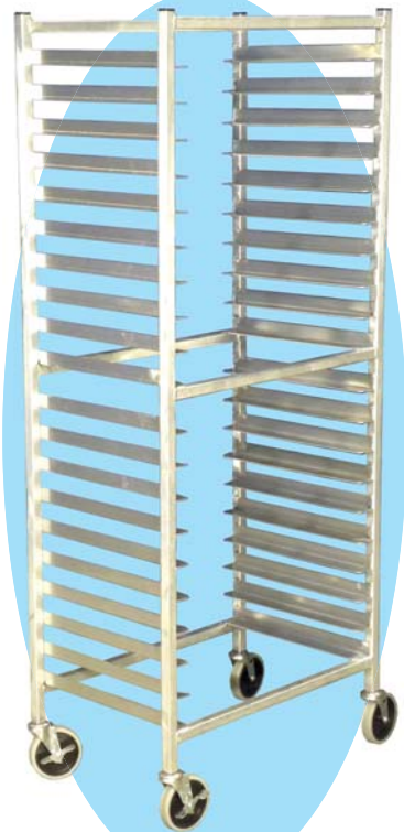
Aluminum, Fully Welded, Side Load # DL102019