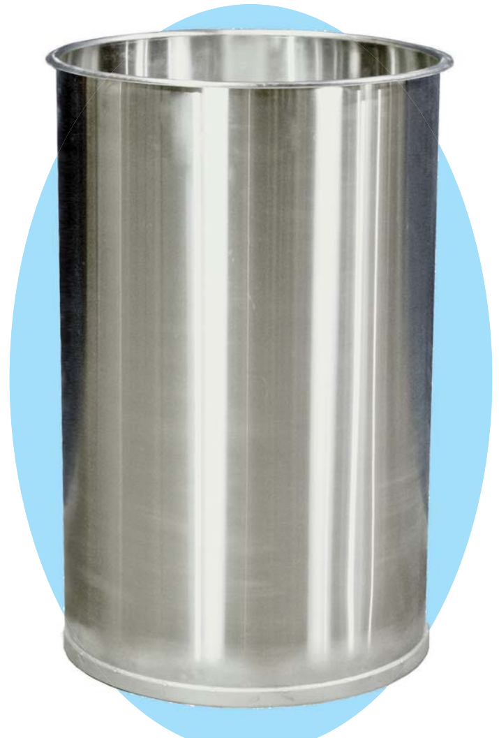
Model shown: DM101001