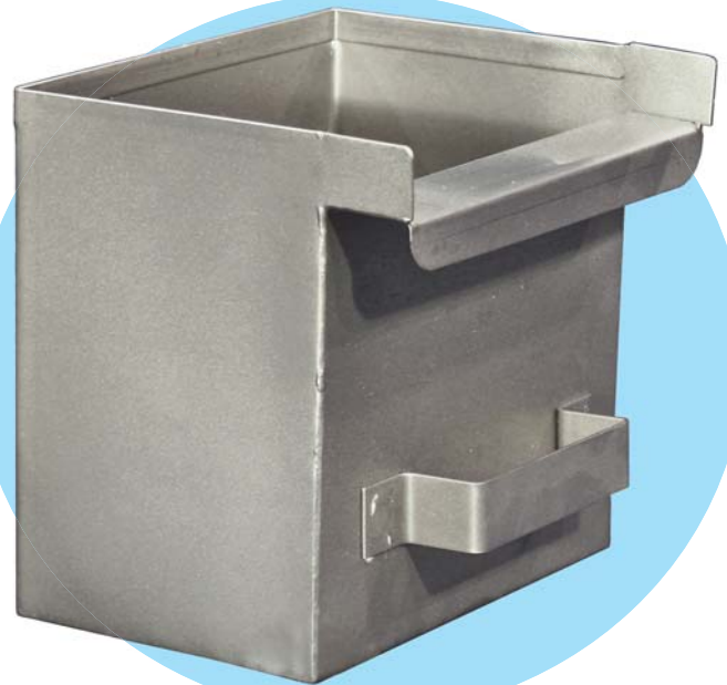
Knife Sterilizer, No Hole SZ101001

Our Stainless Steel Knife and Cleaver Sterilizer boxes are commonly used in food processing industry. We have designed it with a built-in flange to hang from the lavatory rim so the overflow lip channels excess water into lavatory bowl. Boxes are top opening and can be used with immersion heaters or steam lines.