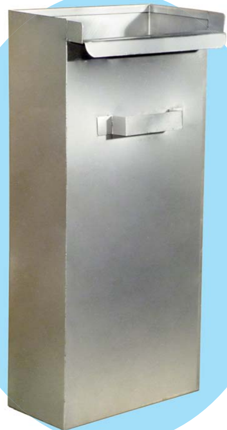
Cleaver Sterilizer, No Hole SZ101005

Constructed with rustproof heavy gauge T-304 Stainless Steel, our boxes are fully welded for added strength. Welds are glass bead-blasted smooth.