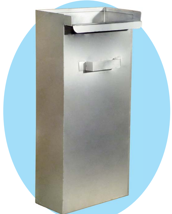
Cleaver Sterilizer, No Hole SZ101005

Constructed with rustproof heavy gauge T-304 Stainless Steel, our boxes are fully welded for added strength. Welds are glass bead-blasted smooth.