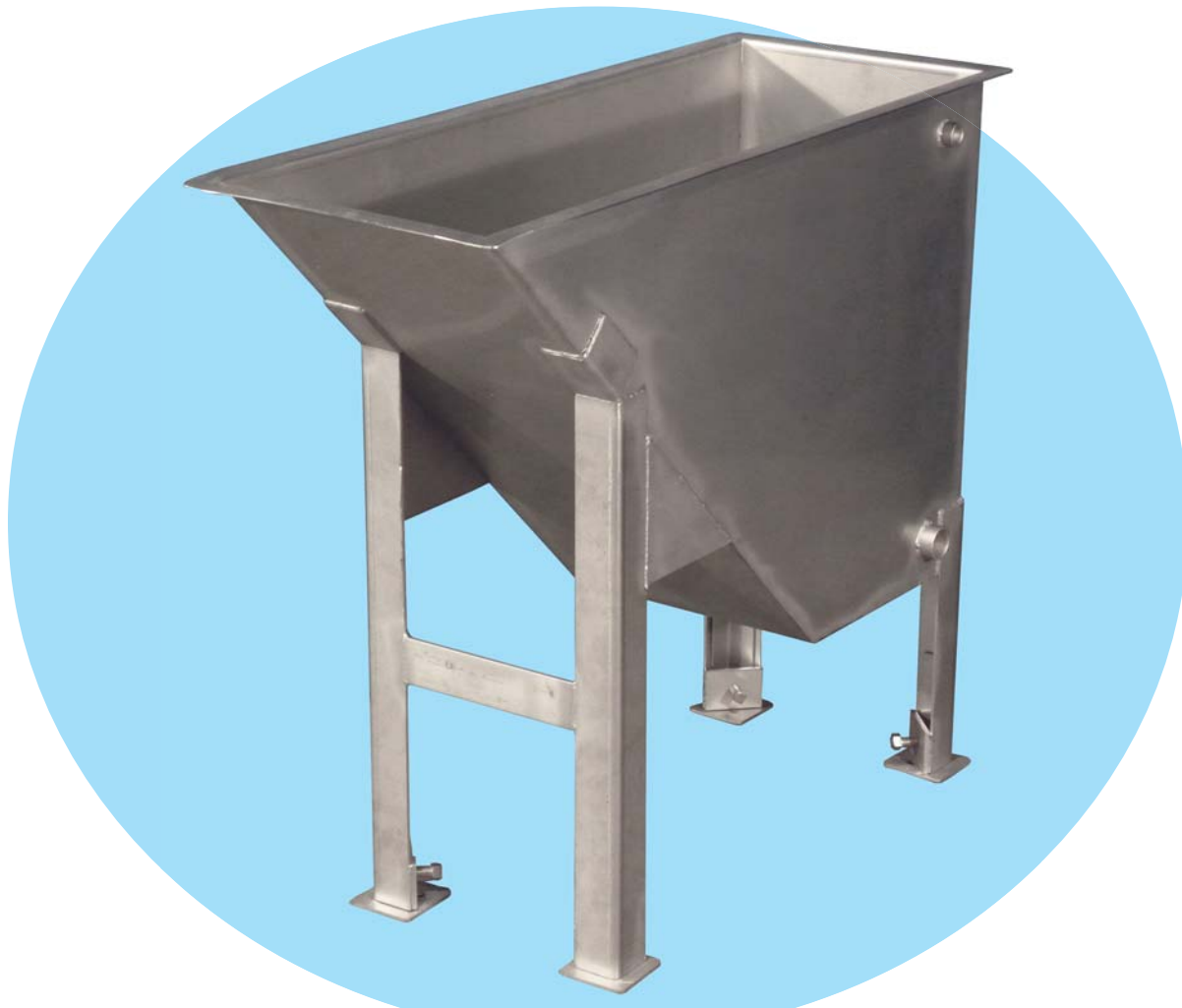
Saw Sterilizer with Steam Coupling - SZ101012

Our Stainless Steel Saw Sterilizer boxes are designed for use in food processing industry. The Saw Sterilizer is produced in three sizes. Model B - for use with "L" type on-the-rail beef breastbone openers and with hog breastbone openers, air or electric. Model A - is for use with all other saws on the floor. Model AH - is for use with platforms. All units feature adjustable legs for leveling, sanitary rounded corners, a 1" overflow outlet on the side of unit as well as a drain in the bottom.