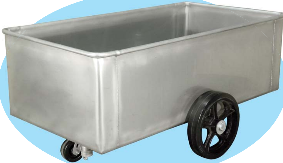
1100 # Center Load - TKS11002