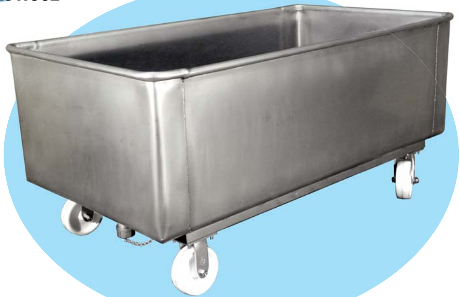
1100# Standard - TKS11001

These Stainless Steel trucks are designed to be used in food processing plants or to move food products from one operation to another. The 1100-lb capacity (17.8 cubic feet) trucks are available in two styles, Center Load and Standard.