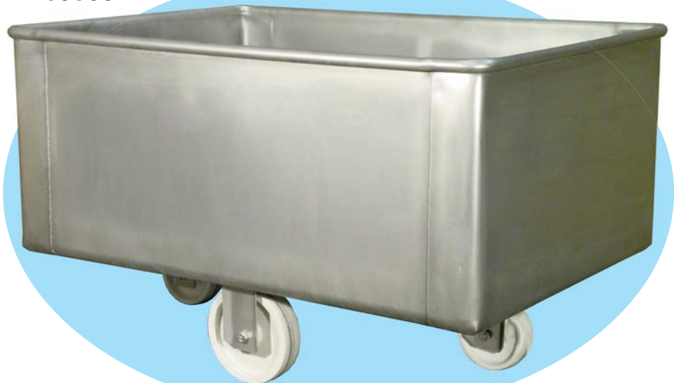
800 # Standard - TKS08001