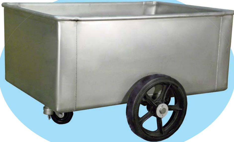
800 # Center Load - TKS08004