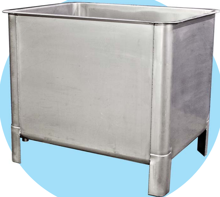
2000 # VAT - VT101002