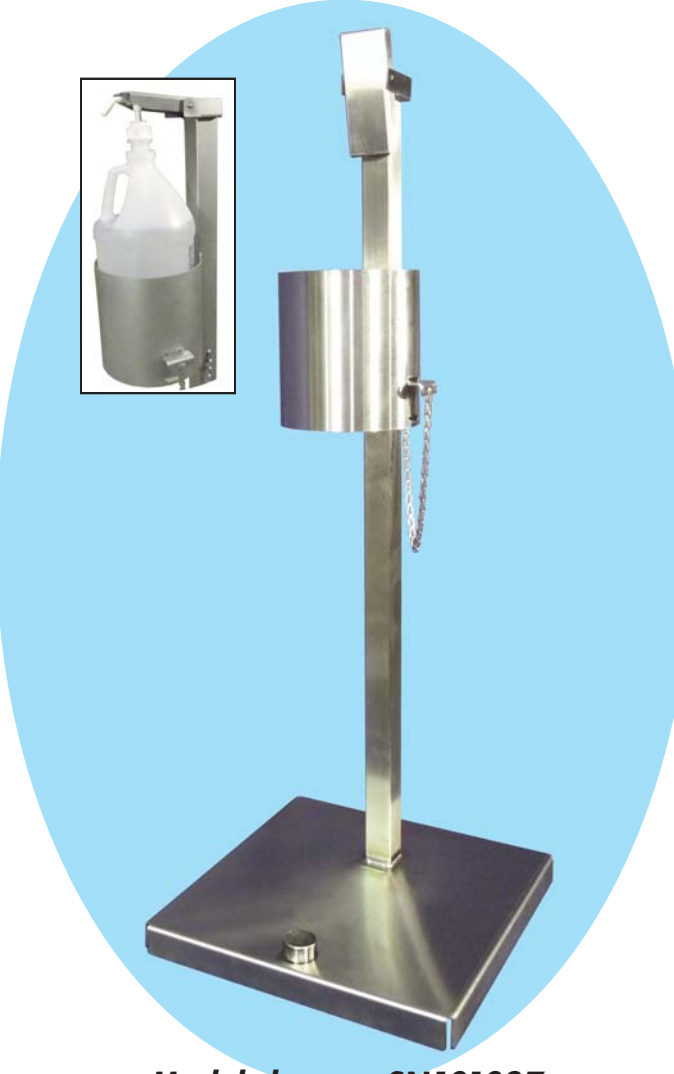
Model shown: SN101027

Our free standing foot operated Hand Sanitizer Dispenser is constructed from heavy gauge T-304 Stainless Steel. Holds a 1 gallon pump style container of your favorite hand sanitizing liquid (not included). Features two-position bottle height adjustment. This unit will arrive fully assembled - ready to use.