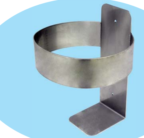
Model shown: HL101002