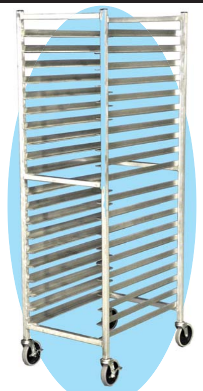
Aluminum, Fully Welded, End Load # DL102018

Used in Bakeries, Grocery Stores, Deli's and meat processing plants for material handling as well as display or storage. Available in End Load or Side Load, Stainless Steel or Aluminum, Fully Welded or Knocked-Down. Knock-Down version will save on shipping and handling charges and includes tool needed for easy assembly. All are equipped with 5" swivel casters (2 with brake, 2 without brake). Sold without platters.