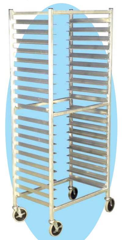
Aluminum, Fully Welded, Side Load # DL102019

All our Platter Dollies are manufactured with heavy duty 1" square tube and are stable for storage or transportation of 18" x 26" Platters. Your choice of rustproof material: Stainless Steel or Aluminum. Features End Loaded or Side Loaded design with twenty levels and spacing between platters of 2-7/8".