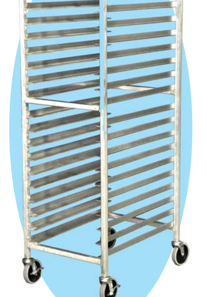
Aluminum, Fully Welded, End Load # DL102018

Used in Bakeries, Grocery Stores, Deli's and meat processing plants for material handling as well as display or storage. Available in End Load or Side Load, Stainless Steel or Aluminum, Fully Welded or Knocked-Down. Knock-Down version will save on shipping and handling charges and includes tool needed for easy assembly. All are equipped with 5" swivel casters (2 with brake, 2 without brake). Sold without platters.