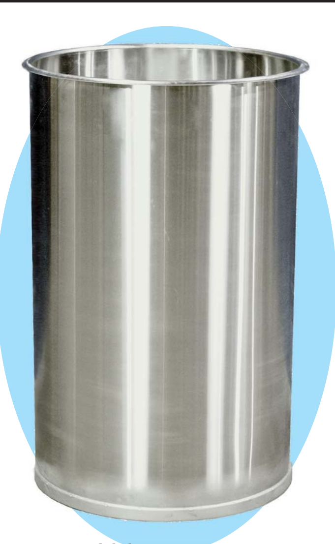
Model shown: DM101001