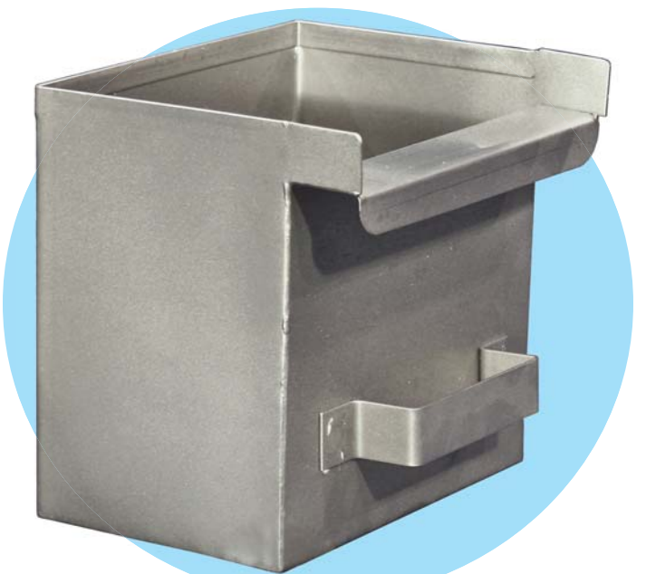
Knife Sterilizer, No Hole SZ101001

Our Stainless Steel Knife and Cleaver Sterilizer boxes are commonly used in food processing industry. We have designed it with a built-in flange to hang from the lavatory rim so the overflow lip channels excess water into lavatory bowl. Boxes are top opening and can be used with immersion heaters or steam lines.