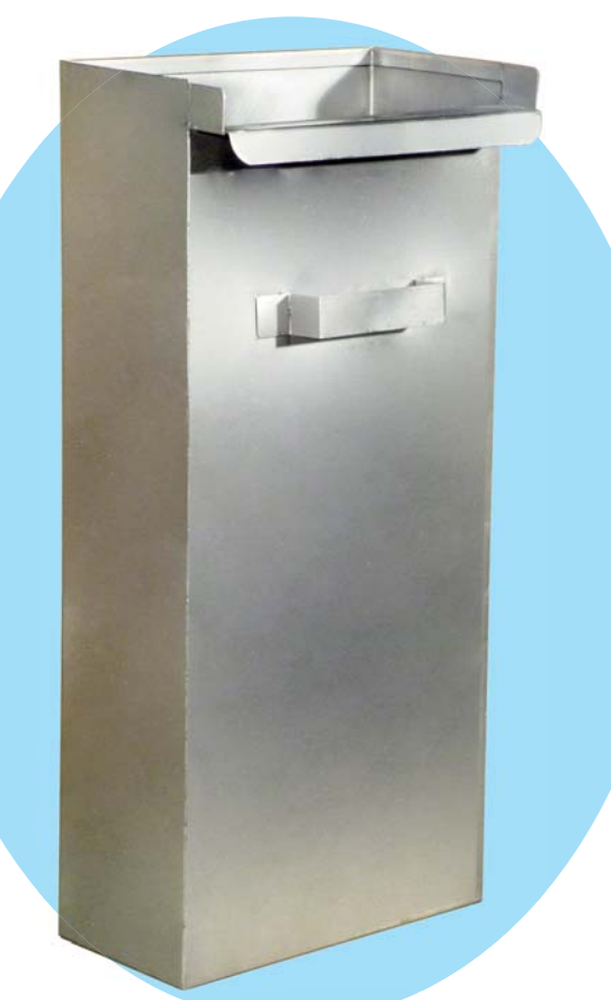
Cleaver Sterilizer, No Hole SZ101005

Constructed with rustproof heavy gauge T-304 Stainless Steel, our boxes are fully welded for added strength. Welds are glass bead-blasted smooth.