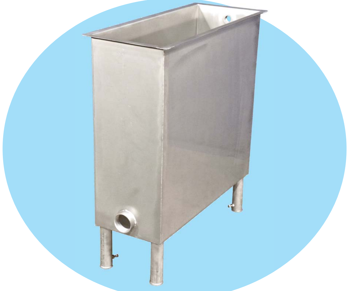
Pan & Shovel Sterilizer with Electric Coupling - SZ101015

Our Stainless Steel Pan & Shovel Sterilizer boxes are designed for use in food processing industry. The Pan & Shovel Sterilizer can be used for sterilizing pluck & viscera inspection pans as well as shovels and head loops. Features adjustable legs for leveling, sanitary rounded corners, a 1" overflow outlet on the side of unit and a drain in the bottom.