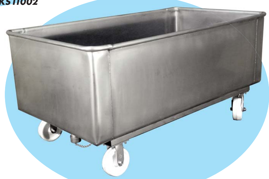
1100# Standard - TKS 11001