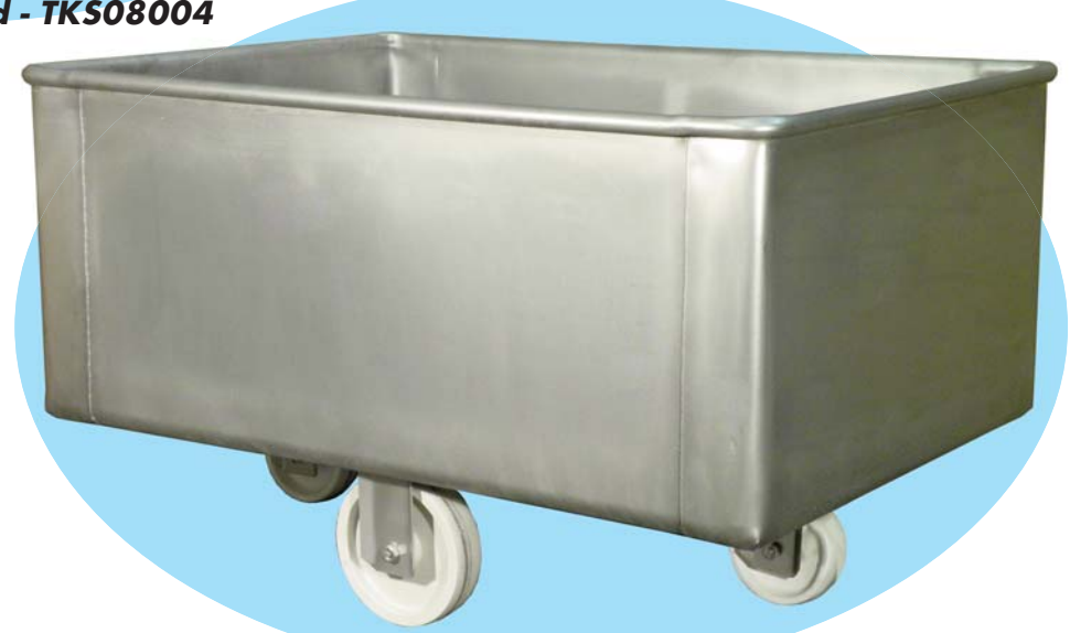
800 # Standard - TKS08001